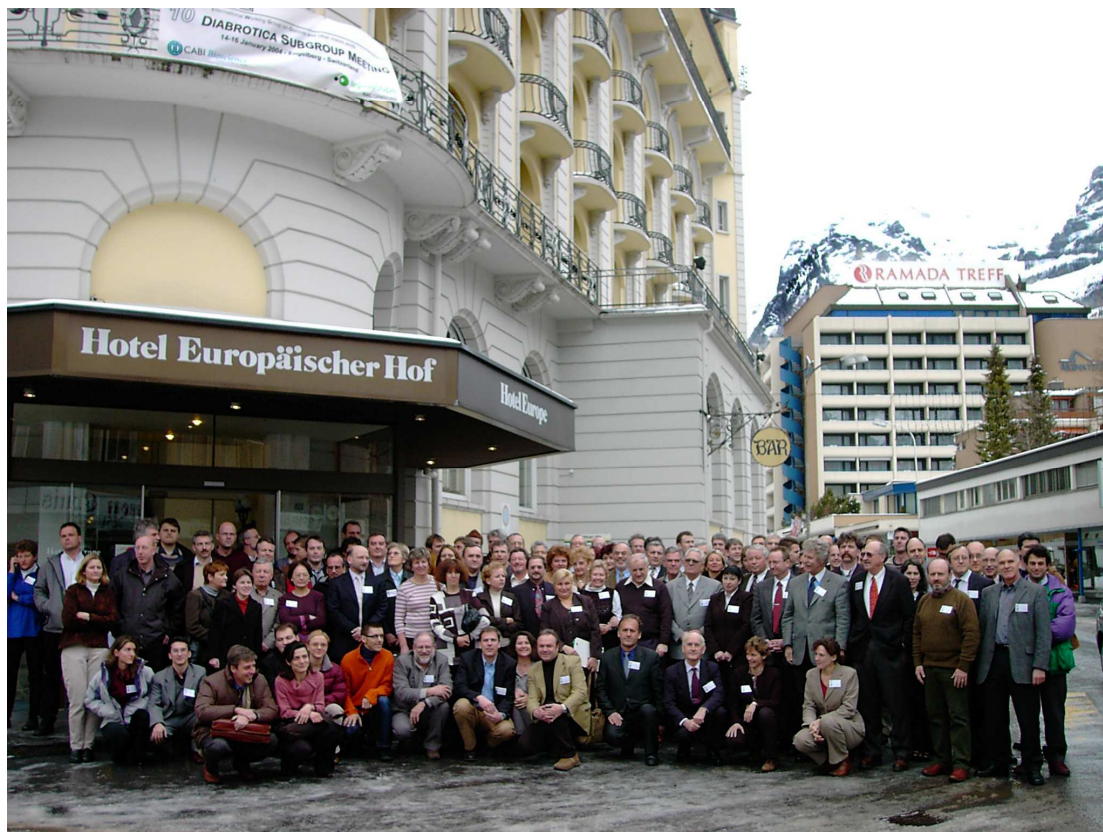
The IWGO – Group in front of the hotel and meeting place of the Xth Diabrotica - Subgroup Meeting in Engelberg, Switzerland